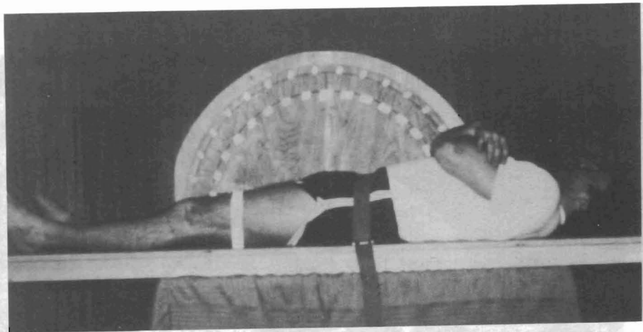
Fig. 1 Goniometer Designed for the Study

Following this initial pre-test which measured active flexibility of the right hip (Figure 2), the remaining S's underwent a further test which measured passive flexibility of the right hip (Figure 3).