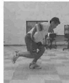
Figure 2. One-leg Squat Jump.