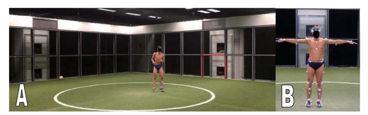
Figure 1: A - Inside of the Footbonaut™, B - Subject with attached Markerset

Sixteen infrared cameras (MX-F40, Vicon, Oxford, UK) were used to collect kinematic data at 200 Hz. Sixty nine retro-reflective markers were attached to anatomical reference points on the subjects skin. Inverse dynamics and muscle force calculations were performed using AnyBody Modeling System (Version 6.0, AnyBody Technology, Aalborg, Denmark). A modified version of the Anatomical Landmark Scaled Model (Lund, Andersen, de Zee & Rasmussen, 2012) was used. Subsequently, data was processed using MATLAB R2015b (The MathWorks, Natick, Massachusetts). Muscle force data was used to calculate muscle stress based on the physiological cross-sectional area (PCSA) reported by Klein Horsman, Koopman, van der Helm, Prosé & Veeger (2007).