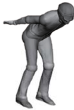
Figure 1: The 3D digital dummy model with joint mobility that was made and used in this study

RESULTS: The distribution of airflow speed around the model were showed in Fig. 2. The temporal changes of aerodynamic characters acted upon ski jumper were shown in Fig. 3. Drag force increases sharply as the jumper stands up (Fig.3(a)). Even though the trends were similar for both jumpers, the variation tendency was not the same. In jumper A's case, there was a gradual increase in the first half and then, for the last four postures, a linear sharp one. On the other hand, jumper B's drag increased progressively in a moderate way, and then increase showed a decrease for the last posture. The drag force acting upon jumper B was over twice as much, at the maximum point (-0.075s), than that of jumper A. Jumper A's drag remains lower than Jumper B's during the whole movement. As for the lift force, jumper B's lift was higher than jumper A's at the beginning, because standing positions were more advantageous for lift force (Fig.3(b)). However, after an increase, the B's curve reached a peak at -0.025s and decreased slightly for the last two positions. In Jumper A's case, lift force increased rapidly in the second part of takeoff. Thus, the B's final lift increase was not as high as A's.