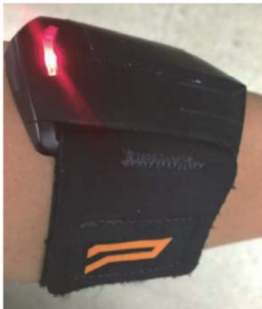
Figure 1a. Placement of PUSH™ band on the forearm.

All participants performed an identical order of dynamic warm-up prior to beginning exercises and also warmed up with lighter weights for the back squat. When they reached the work set, they placed PUSH™ band on their forearm (see Figure 1a). Application software from their smartphone was used to operate the setting. Exercise and loads were chosen from the software (see Figure 1b). Prior to performing the barbell back squat, participants pressed "ready" to start the sensor. They performed the exercise 3x10. When they completed the lift, they pressed "stop". All data were stored data on their application software and exported it out to an excel sheet after the sessions.