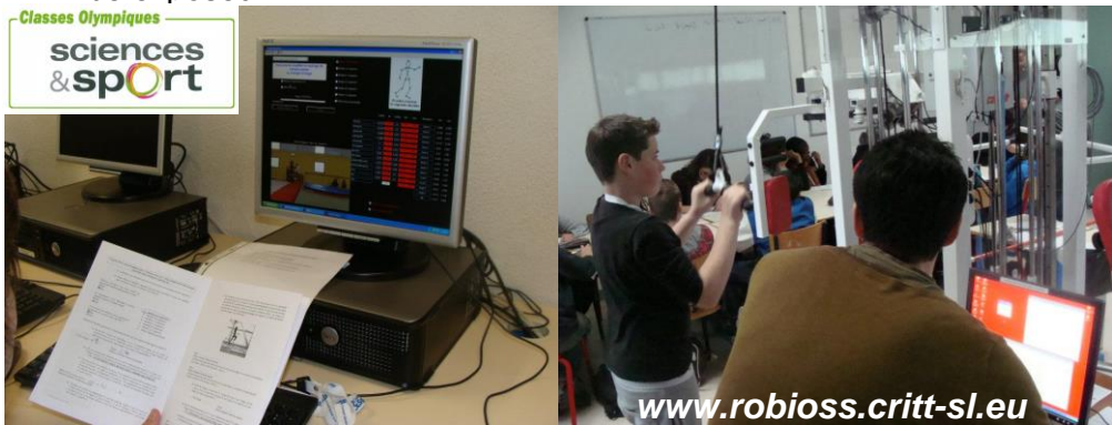
Figure 1: "Olympic Sciences and Sports Classes".

In a second part, the approach used in the biomechanics classes of the Faculty of Sport Sciences of the University of Poitiers to introduce the different scientific theories and concepts taking into account the heterogeneity in the physical education students' initial formation will be exposed.