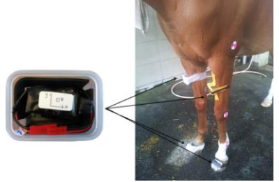
Figure 1: The sensor unit in the casing (left) and the four sensors mounted on forearm and hoof (right).