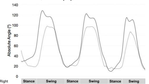
Figure 3: The representative graph of right front hoof kinematic data from sound racehorse (solid line) and lame racehorse (dotted line).