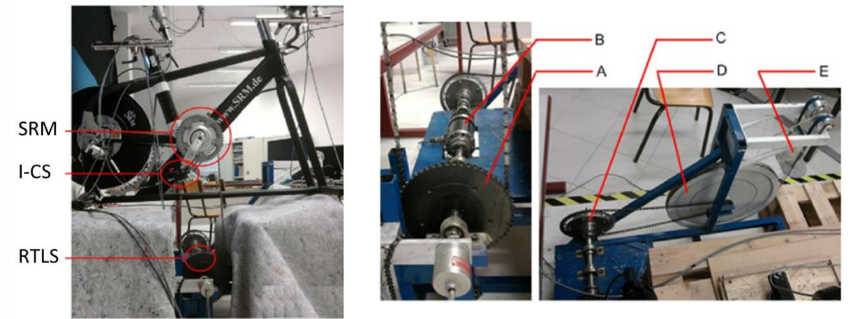
Figure 1: Test bench description: SRM sensor, instrumented pedals by I-CS sensor, RTSL (B), chainrings (A,C), flywheel (D) and mechanical braking device (E).

multiple pedaling conditions included in three conditions presented in table 1. Verbal instructions were given to the cyclist and feedback of mechanical power and cadence were displayed on the "Power Control" SRM bicycle computer.