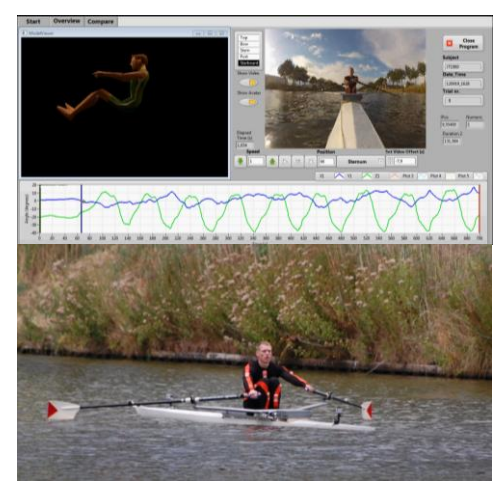
Figure 1: Details of the setup and recording and analysis software. Recording tablet and wireless dongle are mounted in a box on deck behind the rower. Camera's on both decks.

forward force, forward velocity, oar angle, work, forward power and power versus knee, trunk and elbow flexion. This example illustrates clearly the consistency of amplitude and detail in the estimated entities on a similar level in power estimates as in knee, trunk and elbow kinematics estimates. This was observed throughout all experiments. Groupwise (statistical) evaluation of the rower 3D kinematics data revealed consistent high repeatability within subjects over sessions, consistent rower knee, trunk elbow coordination styles characteristics and consistent fatigue induced effects. This data behavior, together with the consistency observed in the power data details as described above, suggests that similar observations can be made for the power data on a group level. This information is however not yet available at the moment of submission of this abstract.