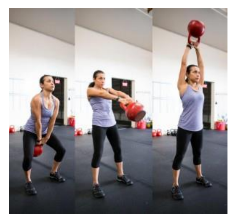
Figure 2. The "American Style" (Swing-Dominant) Swing, characterized by the swing reaching above the eye level to above the head (Crossfit Station, 2014).

METHODS: Nine college aged, right leg dominant, women (mean \pm SD: age = 21.4 \pm 1.8 years; height = 164.3 \pm 5.9 cm; and weight of 67.4 \pm 9.6 kg) participated in the current study. Participants signed an informed consent form and completed a Physical Activity Readiness-Questionnaire prior to participating in the study. Approval by the Institutional Review Board was obtained (HS14-620) prior to commencing the study.