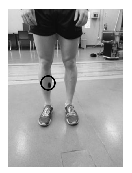
Figure 1: Trigno wireless 4-channel sensor triaxial accelerometer and EMG and sensor placement on the tibialis anterior (arrow on sensor was pointing upwards).