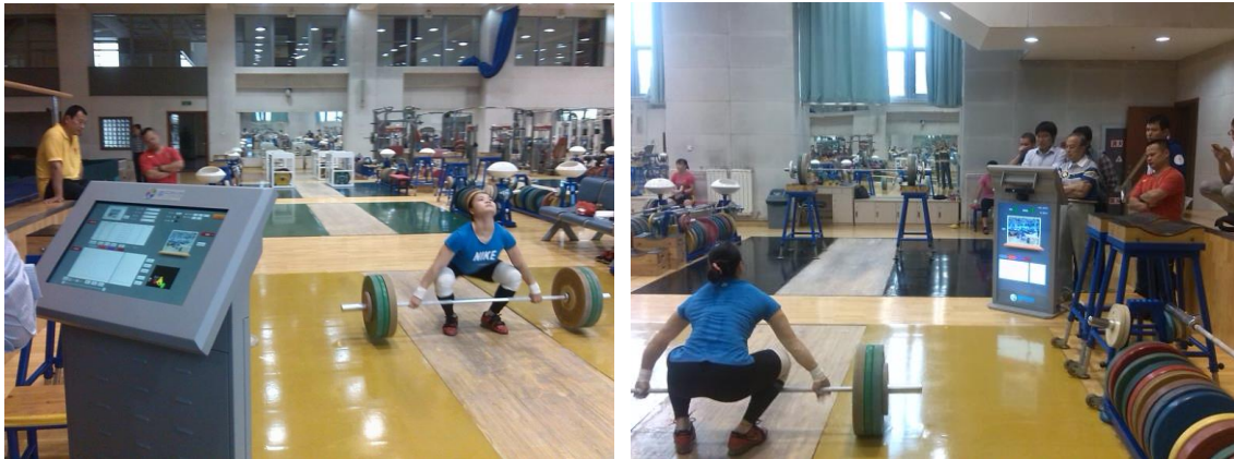
Figure 2: The system used for kinematic feedback in training

the success of intended actions is dependent upon the information provided by response feedback, it is believed that the feedback in real-time is more effective than before.