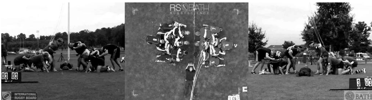
Figure 1: The three camera views (left, right, top) of a typical experimental set-up from Phase 2.

A bespoke control and acquisition system (cRIO-9024, National Instruments, USA) was devised to synchronise the multiple measuring devices and play pre-recorded audio files that simulated the referee's vocal commands with a consistent timing (Preatoni, et al., 2013; Preatoni, Wallbaum, Gathercole, Coombes, Stokes, & Trewartha, 2012). The players' movements were captured by four digital cameras from three different views (top, left and right, Figure 1). Side cameras (Sony HDR-HC9, Japan) operated at 50 Hz and were placed on tripods 18 m far from the centre of the scrum. Top cameras operated at 200 Hz (Sony HVR-Z5, Japan) and 50 Hz (Sony HVR-Z5, Japan) respectively, and were fixed to a horizontal truss at a height of 8 m from the ground. Video recordings were later digitised using Vicon Motus software (v.9, Vicon Motion Systems, USA) and the position of selected body landmarks was tracked to estimate a set of kinematic variables including displacements, angles and their derivatives (Preatoni, et al., 2012).