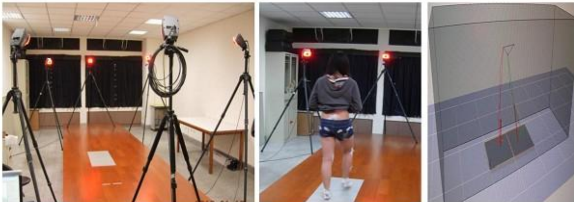
Figure 1: The laboratory setup and experimental procedure for gait analysis.

Myofascial release was performed to stretch the cross-links and changing the viscosity of the ground substance of fascia (Barnes, 1997). The senior physical therapist used a cross-hand technique, slowly stretching out the elastic component of the hamstring fascia with relaxed hands, until the physical therapist reached a barrier. At that point, the physical therapist maintained sufficient pressure to hold the stretch at the barrier and waited 90 seconds or longer until the restriction or barrier released. The ground reaction forces and knee joint reaction forces during the walking trails were compared before and after 6-8 weeks myofascial release on hamstring.