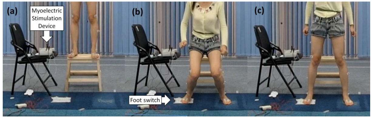
Figure 1: The forward drop landing task in this study. (a) Subject equipped with the myoelectric stimulation device standing at a height of 40cm; (b) Subject jumping off and landing on a footswitch on top of a force plate; (c) Subject returned to a standing position.

METHODS: Females demonstrated greater knee valgus torque during a forward drop landing task (Pappas & Carpes, 2012). Therefore, this protocol was employed in this study. Data from a previous study (Dempsey, Elliott, Munro, Steele, & Lloyd, 2012) were used to determine the number of subjects required, assuming a difference of 0.218 Nm/kg to be clinically relevant. A sample size calculation revealed a minimum of 11 subjects would be required with the adoption of alpha of 0.05 and a power of 0.80, and therefore we invited 12 young healthy female adults (age = 22.3 \pm 3.6 years, height = 1.62 \pm 0.02 m, body mass = 50.2 \pm 4.7 kg) with right limb dominance to perform the above-mentioned task from a height of 40 cm in a biomechanics laboratory, as shown in Figure 1. The university ethics committee approved the study, and informed consent was obtained from every subject before the study.