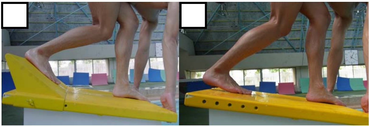
Figure 1: (a) Kick start and (b) track start

METHODS: Eleven male elite collegiate swimmers participated in this study. Characteristics of the swimmers are shown in Table 1. Prior to the tests, the swimmers were given 3 months to practice their starts using starting blocks equipped with back plates. During the trials, swimmers executed the two start techniques in random order. Trials were recorded using three synchronized video cameras (DXC-990, Sony, Tokyo, Japan) equipped with chargecoupled devices and shooting at 60 fps (1/1000 s exposure). Two-dimensional video analysis was performed in the sagittal plane. Images from the video cameras were fed into a computer-assisted motion analysis system (FRAME-DIAS IV, DKH, Japan) to digitize the data. A two-dimensional analysis method was used to calculate the coordinates of the marked points on the bodies of the swimmers. A Butterworth digital filter was used on the coordinates and in image analysis for data smoothing. The digital filter cutoff frequency was set to 3–6 Hz (Winter, 1979). The block time and 15-m time were measured. During block phase, horizontal velocity, speed at take-off, angle of projection and attitude angle were calculated. Additionally, during, entry angle, attitude angle and angle of attack were computed (Figure. 2). Paired t-test was used to compare all variables between the two techniques by SPSS (PASW Statistics 20.0, IBM, Japan). Significance levels were set at p <0.05. In addition, effect size (Field, 2005) was determined for all variables.