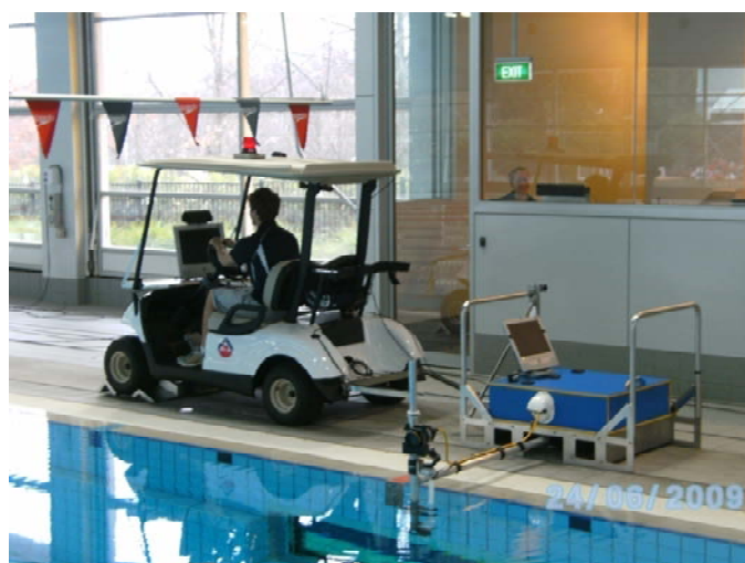
Figure 3: Filming trolley pulled by modified golf cart using two filming cameras (1 above & 1 below the water surface).

Separate to the Wetplate analysis visual image from the four Gig E cameras, there is another image also provided. This image is videoed by cameras that film from a moving trolley that travels along the side of the pool and which is powered by a golf buggy (Figure 3). The image stays level with the swimmer. This provides a split image that combines the view from two cameras, one above and one below the surface of the water. At the present time it provides only analogue video signals which are combined to produce a single video image using an analogue video mixer. There is in addition to the side on footage, an image of the trial from above using another analogue camera. These analogue cameras are soon to be replaced with machine vision Gig E cameras.