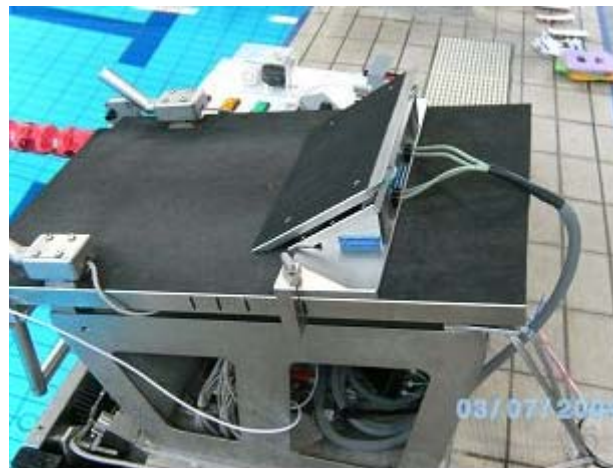
Figure 1: Wetplate starting block including a Kistler force platform with kick plate.

There is also a start button that triggers the start signal and is initiated by the starter who stands behind the starting block. The signal from this button is also transferred by an electrical pulse to the Wetplate computer via the analogue to digital board. A box which is located beside the starting block has a number of indicator lights for the visual indication of events that have occurred. These indicator LED lights are primarily there to display the instant of an event during the visual playback of the trial. The LED lights display an indication of events including: the start signal, when the swimmer left the block, when the front wall was touched in turns and when the relay touchpad has been activated by the incoming swimmer, swimming into the wall during relay changeovers. The LED indicator receives its signal concerning the leave block time through the reconnection of a red LED beam across the front of the start block. The swimmer's feet block the beam prior to the swimmer leaving the block. Four Gig E Pulnix Machine vision cameras are used to provide visual feedback of a trial. All cameras are synchronised to run at 100 frames per second. The cameras cover the lateral or side view from behind the start block out to the 15 m mark from the wall. One camera films from above water to capture the above water activity during a start and turns. The other