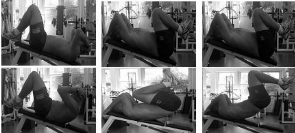
Figure 1: Initial (upper) and final (lower) positions of analyzed exercises. From left to right: curl up (C), reverse (R), reverse with pelvic tilt (P).

Electromyography: Disposable surface electrodes were placed over both portions of rectus abdominis muscle, three centimetres superior and inferior in relation to umbilical scar, and three centimetres to the right side. Before the electrode placement, skin was shaved and cleaned with alcohol. These procedures followed the recommendations of Cram and Kasman (1998). The EMG signal was collected with ME3000 electromyograph (Mega Electronics Ltd), sampled at 1000Hz and filtered with pass-band of 10-500Hz.