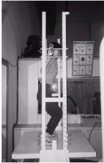
Figure 1 – PRP training machine.

third set were both five repetitions with 80% of lower limbs maximum strength, the fourth set was three repetitions with 90% of lower limbs maximum strength.