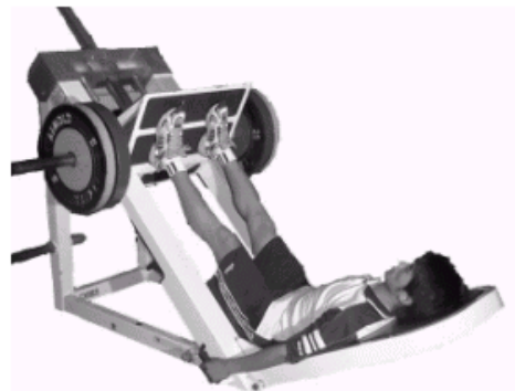
Figure 3–The maximum strength test.

The lower limbs maximum strength and vertical jump were evaluated in pre-training and post-training period. The lower limbs maximum strength represented the muscle strength in present study. All subjects used their maximum strength to press the loading on the leg press of Cybex (shown in Figure 3). The best performance of vertical jump in three measurements represented the muscle power in present study. All subjects were tested without approach running and swing arms. SPSS for Windows was used to do the statistical analysis, and the repeat measurements t-test and independent samples t-test were employed to analyze the data. The significant levels was set at 0.05.