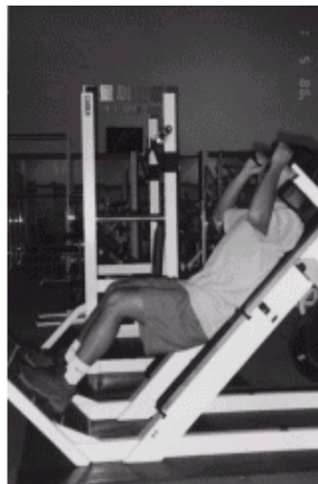
Figure 2–Traditional weight training.