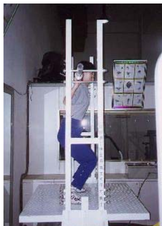
Figure 3 –PRP training.

Testing Procedures: Testing was conducted over two sessions. During first sessions, each subject was measured one repetition maximum (1RM) of load for the half squat by the Cybex of Hack Squat Station. The second session began with general warm-up involving three sets of 5