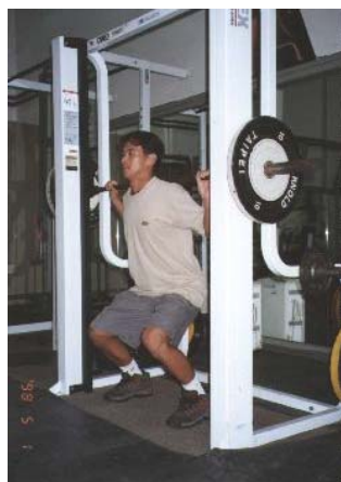
Figure 2 –Traditional weight training.