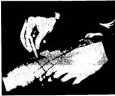
Figure 1. Illustrated schematic experimental procedure. DOMS was evaluated for the 24 sites on each lower leg.

After analog-to-digital conversion on EMGs, a data reduction was applied to mean power frequency and integrated EMG. A mean spectrum was then computed by calculating the root mean square values of 16 spectra obtained from consecutive time windows of 500 ms duration. The resulting spectrum was defined by 256 points in amplitude and phase in the 1 to 1025 Hz bandwidth. Meanwhile, the amplitude values were transmitted to a microcomputer by means of a GPIB (IEEE 488) interface system. The total EMG power (PEMG) and the MPF was computed from the mean spectrum. Muscle soreness was analyzed by a nonparametric Wilcoxon matched-pairs signed-rank test. Average and analysis of EMG for each repetition, averaged over the 16 repetitions, were analyzed with the use of a repeated-measures analysis of variance. Statistical significance was set at P < 0.05 .