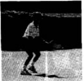
Figure 1: The Preparatory Phase

B. Preparatory Movements: Movement from the ready position to the ball initially requires the body to be accelerated towards the court with a velocity of approximately0.5 ms<sup>-1</sup> (Elliott et al., 1989-Figure 1). Deceleration of the body then applies stretch to the muscles which results in the subsequent storage of elastic energy, which may then at least partially, assist the lower limb drive in moving the player to the vicinity of the ball (Komi and Bosco, 1978).