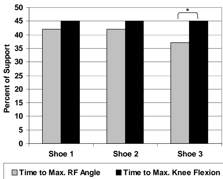
Figure 1 - Timing of knee and rearfoot angles as a function of midsole density.

JOINT COUPLING: Attacking the same coupling problem, Hamill et al. (1992), in a two-dimensional study, attempted to show that an extrinsic factor could also influence the relationship between tibial rotation and pronation although they did not measure tibial rotation directly. They suggested that this extrinsic factor, shoe midsole density, could influence the degree of pronation and therefore disrupt the timing of internal tibial rotation (Fig. 1). The midsoles in this study ranged from very hard (Shoe 1) to very soft (Shoe 3). Shoe 3 produced the greatest discrepancy in timing and was thus thought to present the greatest potential of injury to the runner. It was assumed that increased pronation could exacerbate overuse injury.