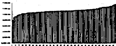
Fig. 2. Rohrer's index.

In general the characteristic of the tested group was homogeneous with regard to body construction. Rohrer's index - Fig. 2 - ranges from 8.12 \cdot 10^{-6} \text{ kg/cm}^3 to 13.74 \cdot 10^{-6} \text{ kg/cm}^3 .