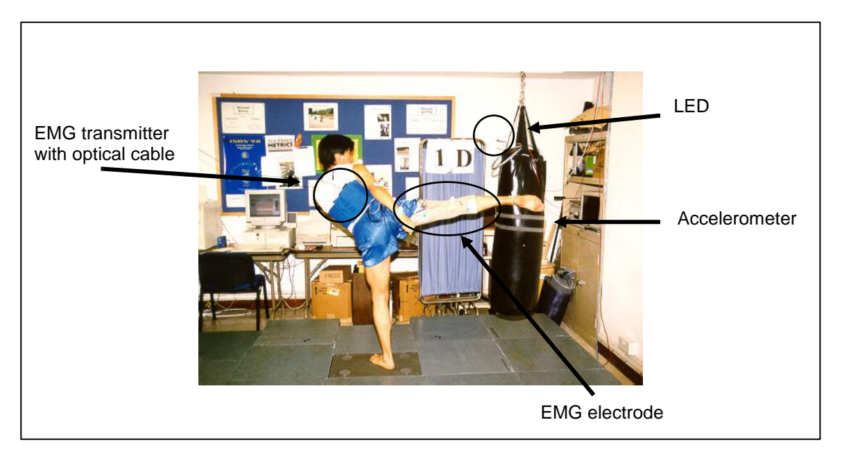
Figure 1 - The laboratory setting of the Taekwondo roundhouse kick EMG analysis.

The raw EMG signals were low-pass (600 Hz) and high-pass (10 Hz) filtered and simultaneously A/D-converted (PCI-6071E, National Instruments, USA) at a sample rate of 2000 Hz for each channel. The rectification of EMG signal and integration of EMG (IEMG) signal were calculated by an analysis software (LabView, USA) with simultaneous visual control of the signals on the computer display. Figure 1 showed the experimental design of this study.