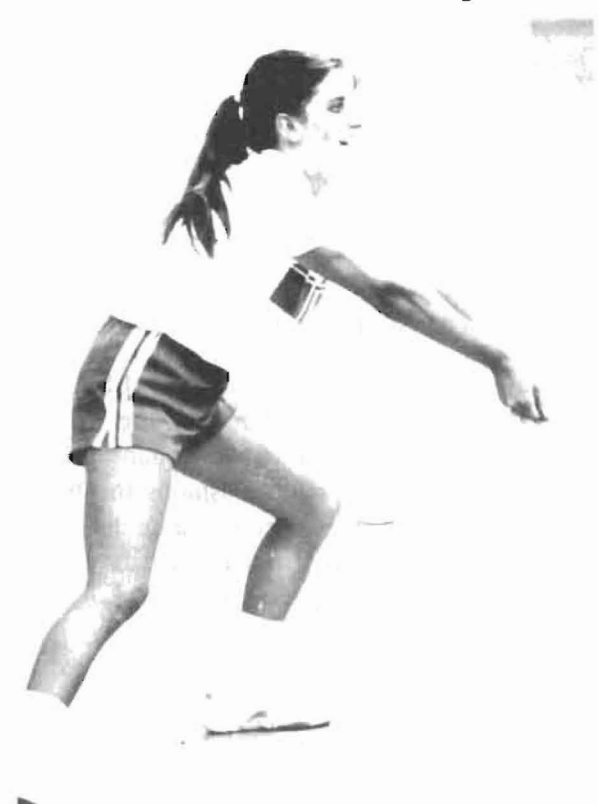
Fig. 3 Subject #1 of HS Group.

Figure 3 shows one of the high skilled passers executing the forearm pass and Figure 4 shows one of the low skilled passers. Several of the differences between the two levels of passers are depicted in the photos. The main factors causing the LS group to pass too high appears to be the more upright trunk position at time of ball contact. Also the large range of motion the upper arms go through and the high angular velocities in the shoulder joint at contact contribute to high passing angles and high projection velocities. In most passing situations the passer uses the arms and body to attentuate the force of the incoming ball because accuracy is the primary objective of the forearm pass. The LS passers appeared much more rigid and «stiff» in their passing actions and were unable to absorb the force of the ball and redirect it to the targer consistently.