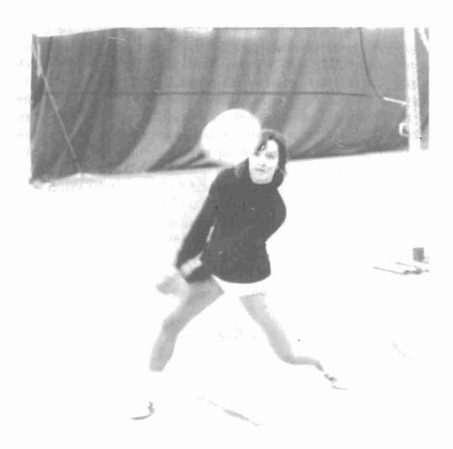
Fig. 4 Subject #4 of LS Group.

The contact point on the forearms for the LS group was not as cushioned an area as a position farhter from the wrists would afford. Force absorption and passing accuracy are enhanced by contacting the ball on a fleshy part of the arms that cushions the ball in addition to providing a large, flat surface area for rebounding the ball. The HS group passed an inch or two higher up from the wrists and this seemed to provide a better contact area. Several LS passers could be observed passing off the wrists and thumbs.