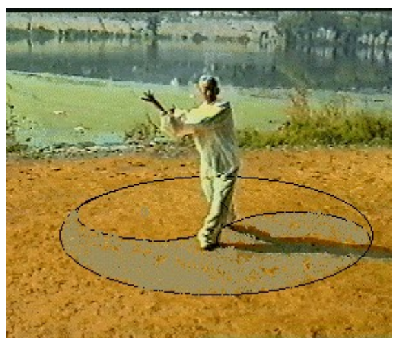
Figure 1 - Body spiral, continuous movement along Tai chi Symbol with Bagua gait.

INTRODUCTION: Tai chi and Bagua are forms of Chinese martial art that consist of exercise techniques and self-defense disciplines. They are characterized by gentle, slow and continuous movements. The major difference between these two disciplines can be seen in the direction of movement. Tai chi is performed along a straight line, whereas the movements of Bagua are performed with practitioners walking around a circle with Bagua gait (Fig1). Both Tai chi and Bagua were employed as effective self-defense techniques in ancient battlefields before rifles and cannons were used in China. Today, many people practice it for sports, health and fitness. recreation rehabilitation.