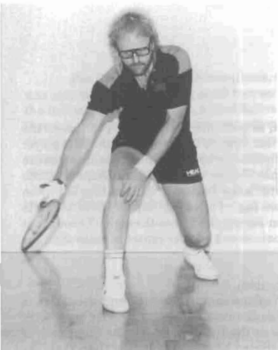
Figure 1, continued.