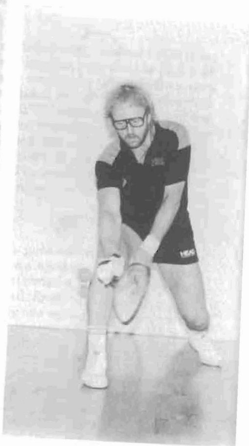
Figure 1, continued.