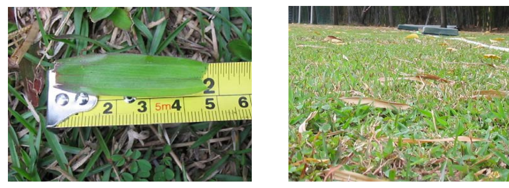
Figure 2. The size of grass and the overview of grassland

METHOD: Two athletes (2 male) participated in this study. Age, body weight and stature of the participants were 33.50 \pm 0.71 years, 64.77 \pm 4.82 kg and 169.50 \pm 0.71 cm respectively. Their training frequency was 3 hours per section and 3 sections weekly. All subjects were asked to perform the snowshoeing on sand and grassland with their maximal speed for about 30m in distance. The length of grass is about 4.5cm and width is ranging from 2 to 8mm (see Figure 2). A 3CCD digital camcorder with 50Hz filming rate (SONY TRV-950E PAL) was located 14 meters away from the subject and the shutter speed was set at 1000Hz (see Figure 2). A section of running motion was video recorded. The video material was then converted into computer format for further analysis with motion analysis system (APAS). Kinematics parameters such as single leg support time, flight time, stride frequency, velocity of CG, vertical displacement of CG, cycle length, thigh and knee angle were calculated. The descriptive statistics of the snowshoeing kinematics parameters were computed by SPSS statistical software.