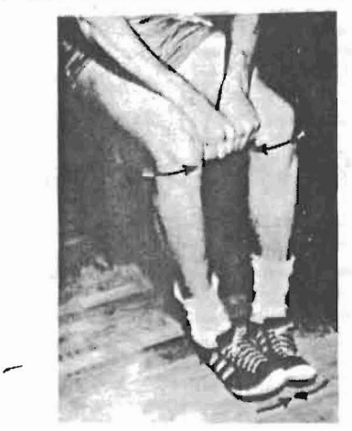
Figure 3—Isometric Exercise. Sit with knees flexed to about 115°, feet 3.4 inches apart, foot-ankie angle about 90°, toes pressed together, fints between the knees. Lock heels on the floor, press toes together hard, and squeeze the knees together against the fists with maximum effort. Hold ten seconds—relax. Repeat 4.5 times in series, 2.3 times daily. This exercise strengthens the muscles on the inside of the ankle (tibishis posterior and flexor hallicus longus) and aids in controlling pronation. The knee squeeze phase strengthens the muscles that turn the lower less ins.

Early use of the "Rear Foot Controls" is an important first step in the correction of mechanical errors in running. They are especially effective in early training because they immediately promote better foot and leg function. This aids in the development of proprioceptive action for muscle function. "Rear Foot Controls" are also important during phases of muscle fatigue because they continue to maintain proper foot-leg function when the musculature tends to lose its effectiveness in action.<sup>9</sup>