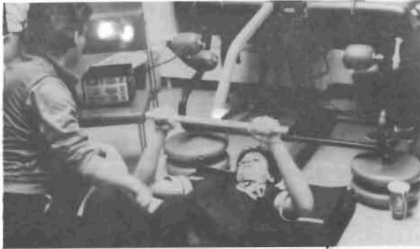
Figure 3., Arm Strength Assessment