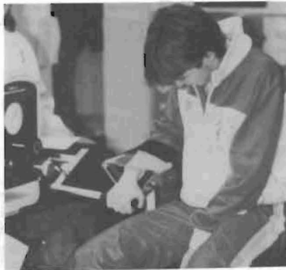
Figure 4., Wrist Strength Assessment

All subjects performed a maximal effort wrist flexion with their shooting hand on a Cybex II, isokinetic dynamometer set at a speed of 60 degrees per second (Figure 4). The best of three peak-torque readings were recorded as the player's maximum wrist strength. These values were determined from strip chart records of the wrist torques. The action of wrist flexion was examined because it simulated the action of the wrist used in dribbling and shooting a basketball. Both the Cybex II and the modified Hydra-Gym dynamometers were routinely calibrated prior to each test session.