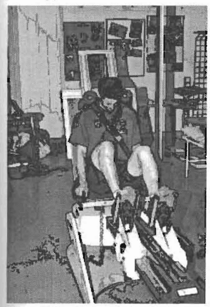
Figure 2: Contrex Legpress.

Contrex Legpress: Alpine ski racers require high eccentric and concentric force development and have demonstrated high leg strength when compared to other athletes. The Contrex linear leg press is utilized for closed-chain testing of the lower extremities. It can measure both