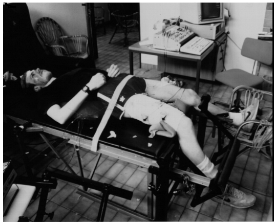
Figure 1. Position of subject before measurement.

METHODS: Nine students of physical education (age 23.4 \pm 2.7 years, height 176.9 \pm 3.3 cm, mass 70.4 \pm 4.9 kg) gave their formal consent and volunteered for the study. They were acquainted with all the measuring protocols. Three Wingate tests were performed: 15 s, 30 s and 45 s test. Fatigue index as a drop in power during cycling (Bar-Or, 1987), blood lactate concentration and tetanus forces at 20 and 100 Hz electrical stimulation for the vastus lateralis muscle were measured. Before all tests and measurements, the subjects warmed-up with the standardized protocol. Electrical stimulation measurements were obtained four minutes before and one minute after the workout. Two transcutaneous stimulation electrodes (Axelgaard, Falbrook, CA) were placed over the distal and middle parts of VL of the right leg (Fig. 1). The amplitude of stimulation was three times the motor threshold of the subject, which was established by 0.8 s long trains of electrical impulses delivered at 100 Hz. The amplitude was held constant during both tests. The same