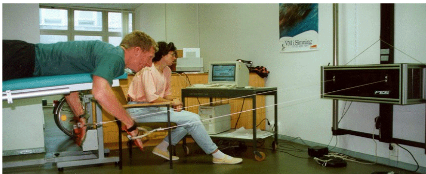
Figure 1: Equipment for investigations in swimming

METHODS: The arm pulling ergometer is the official diagnosis equipment of the German Skiing Association, the German Swimming Association and the German Triathlon Association. Within the diagnostic protocol athletes perform two tests of speed strength and strength endurance. Additionally, the arm pulling ergometer may be used for measurement in training.