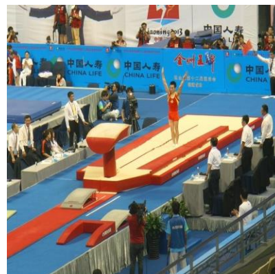
Figure2: Game site photo

RESULTS AND DISCUSSION: In order to facilitate the analysis of the data, we divided the whole movement into four stages.