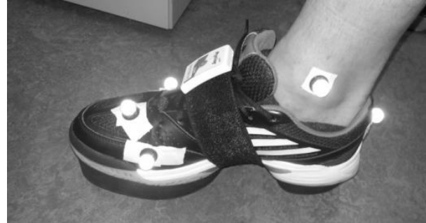
Figure 2: Placement of Physiolog4 and markers

Testing consisted of walking in normal condition (shoe sole the same height) and the limp condition (right shoe with increased sole thickness) for each self-selected slow, medium and fast velocity. For each condition one left and one right step placed on the force plate were identified using a video system (Panasonic). Five representative parameters of these steps automatically calculated by the GaitUp software were comparatively analysed with the same parameters calculated with V3D using from the motion capture data: gait-cycle time [s], stride length [m], stride frequency [stride/min], gait velocity [m/s] and foot angle at heel-strike [°]. Statistic calculations yielded absolute differences and Pearson's correlation coefficients for comparing the two corresponding data sets for each setting and parameters of interest. Blant-Altman plots were used to visualise the amount and tendency of the system deviations for the different conditions. Data analysis has been performed for the right limb only.