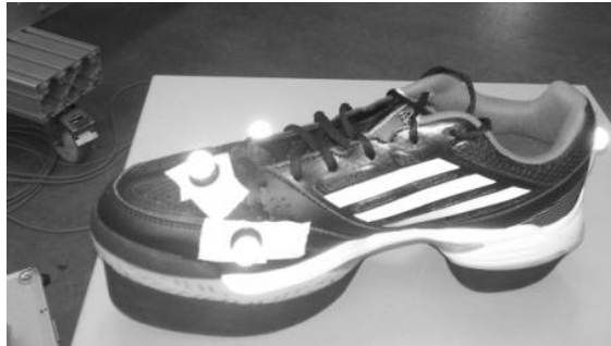
Figure 1: Modified shoe inducing limping

walkway were used to identify the time of heel-strike and toe-off. Participants walked in normal and induced limping conditions. For the normal condition a custom training shoe was worn on both feet. To induce a limping mechanism, a modified shoe with a sole thickness of +2.5 cm was put on the right foot instead of the regular shoe (Figure 1). For simultaneous analysis the Gait-Up Sensor Physiolog4 was adjusted at the foot according to the instructors guidelines and reflective markers were placed at each shoe (1 st , 2 nd and 5 th metatarsal joint, heel) and both ankles (medial and lateral condyles) of the participants (Figure 2).