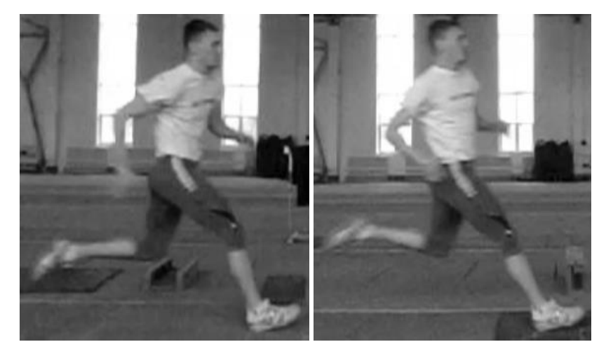
Figure 2: Jumper's position at touchdown in three-stride (left) and twelve-stride (right) run-up long jumps.

The present study has shown that in long jumps from incomplete run-ups not only do takeoff velocity and takeoff angle change, but so do many other characteristics of the takeoff technique. In a long jump from a three-stride run-up, the jumper puts their foot closer to the projection of the CG on the horizontal plane to create a larger takeoff angle, while their knee angle is smaller than in long jumps from eight- and twelve-stride run-ups (Figure 2).