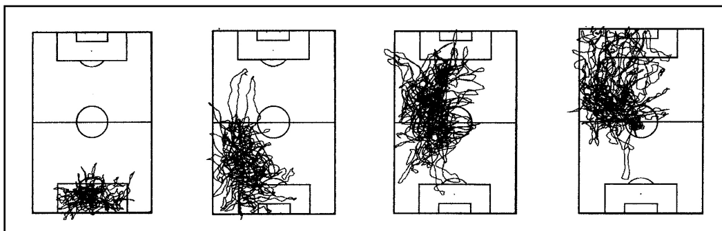
Figure 2: Position in the pitch in 45 min. (from the left): goalkeeper, defender, midfielder, attacker.

For every player the following data were gathered: time of play, position in the pitch (Figure 2), distance covered, velocity (Figure 3), acceleration. Based on physiological approach (Eckblom B., 1986; Bangsbo and Lindquist, 1992; Chmura, 1997; Jastrzebski, 2004) and at physiologists' request anaerobic threshold was introduced and acquired at 4.0 m/s level for adults (seniors and Olympic teams) and 3.7 m/s for junior teams. For sprint movement data over 7.0 m/s for adults and 6.0 m/s for juniors were acquired. For acceleration movement data over 2 m/s 2 were acquired (time and distance covered).