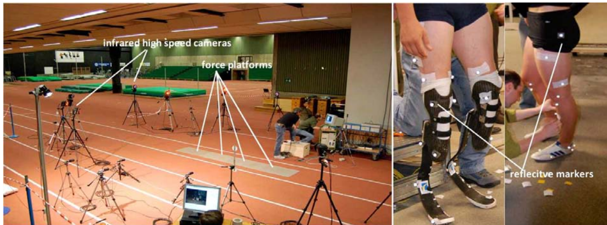
Figure 1. Representation of the experimental setup. Left: Indoor running track, camera system and force plates. Middle and right: Marker placement.

A more comprehensive description of methods and material used in the measurement can be found elsewhere (Brüggemann et al., 2008).