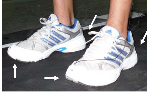
Figure 1. There are two markers on the front tips of toe boxes and heel counters of each shoe. The positions of the four markers are at the same level (arrows).

RESULTS: The results of the experienced subjects (Table 1) and inexperienced subjects (Table 2) indicated that thirteen subjects (eight experienced and five inexperienced) increased their step lengths after thirty-minutes of running. By comparing the step widths at the 5 th minute, nine subjects (five experienced and four inexperienced) enlarged their step width at the 30 th minute. Although there was no statistical analysis in this study, the mean normalized step length increased for both the experienced (46% increase to 52% of height) and inexperienced groups (48% increase to 51% of height). The increased mean step width (17% increase to 20% of height) was only found for the inexperienced subjects. Excluding Subject 15, however, the differences in the step width are not significant for the other inexperienced subjects.