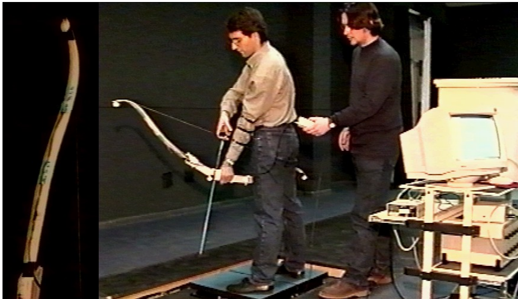
Figure 1 - Set up of the measurement chain and detail of the bow.

METHODS: The measurement chain consists of an EMG system synchronized with an ELGoniometric (Biometrics) system, used to detect the postural adjustments of the subject as well as the strain of the bow during the drawing of the string (Fig.1) using surface active electrodes (Ag/AgCl) of 0.5cm diameter.