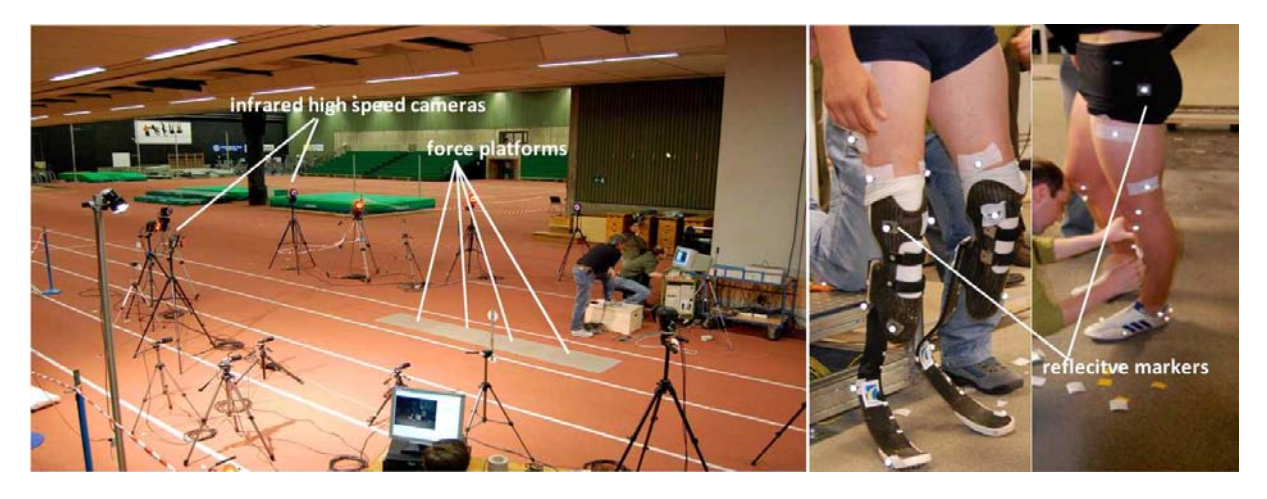
Figure 1. Representation of the experimental setup. Left: Indoor running track, camera system and force plates. Middle and right: Marker placement.

A more comprehensive description of methods and material used in the measurement can be found elsewhere (Brüggemann et al., 2008).